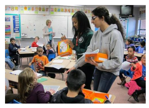
Beverly Park students gain valuable oral health lessons!