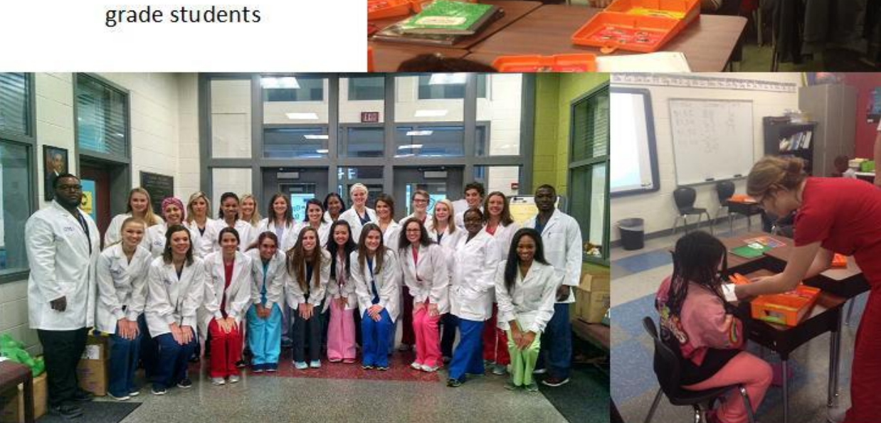
Public School 76/ Harlem Children's Zone really embraced all of the information that Lessons in a Lunch Box has to offer.

1<sup>st</sup>, 2<sup>nd</sup> and 3<sup>rd</sup> grade students