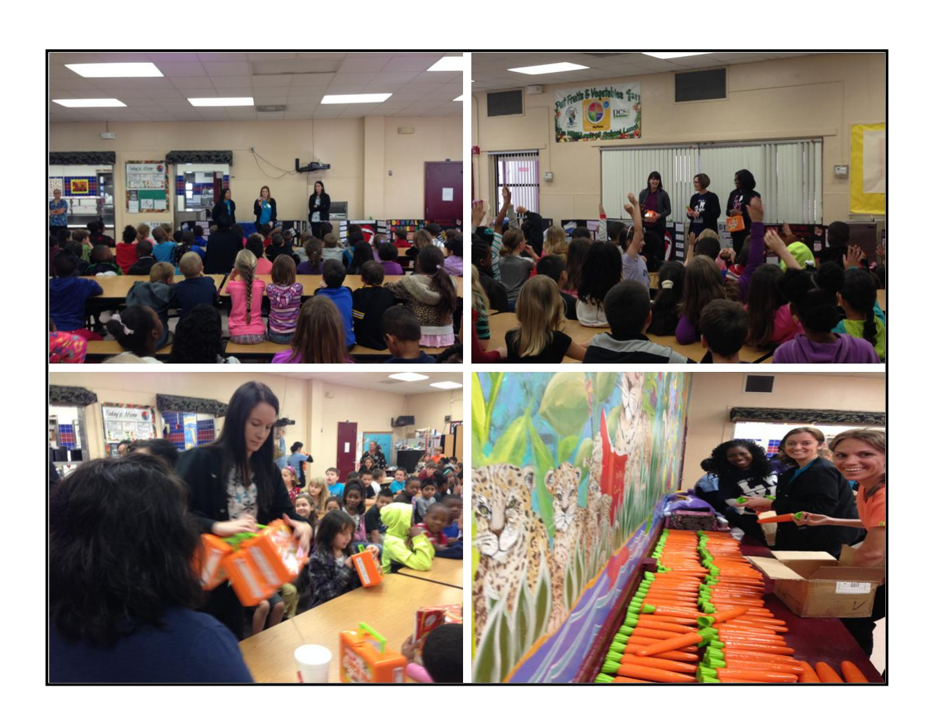
St. Petersburg College School of Dental Hygiene team up to provide oral health education at the 74<sup>th</sup> St. Elementary School.