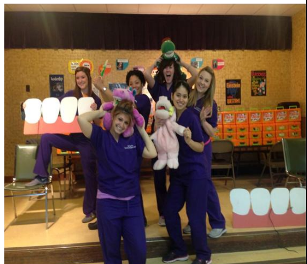
Virginia Commonwealth University student hygienists' enjoy presenting the Lesson in a Lunch Box program at Westover Hills.